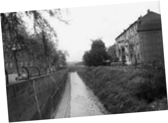
The Borbecker Mühlenbach stream next to a school yard, Essen, 1955

One of the key components of the exhibition are the photographs from the Emschergenossenschaft archive . The glass plate photography negatives section of the archive contains approximately 40,000 objects and is currently on loan to the Ruhr Museum's photo archive. The negatives document the cooperative's construction sites and were used to support project planning activities and the monitoring of construction measures. The negatives archive is also a photographic and social-historical treasure that reveals the development of settlements and industry in the Ruhr area over a period of more than 100 years . The photographs show an enormous landscape transformation – landscapes shaped by humans but also destroyed. Highlights here include panoramic photographs and before-and-after shots that document the changes made along the way. The historical images also show the technical feats the Emschergenossenschaft achieved with its buildings and facilities. This also applies to human achievements, as the photos make clear just how much hard physical labour was required to complete all of the cooperative's projects.