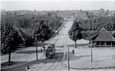
Access bridge with tram and shelters, ca. 1912