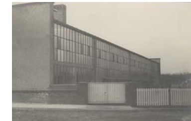
"Großes Atelierhaus" (big studio house), built in 1929