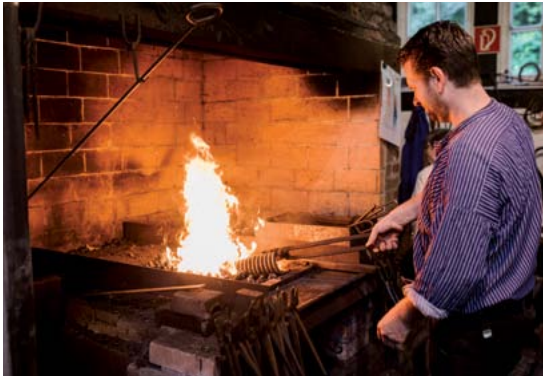
Forging demonstration at the Halbbachhammer