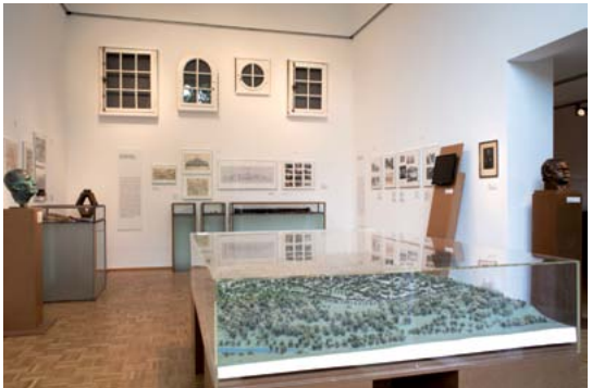
View of the permanent exhibition