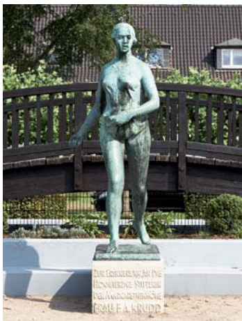
The sower, 1934, sculpture by Joseph Enseling © Ruhr Museum, Photo: Rainer Rothenberg