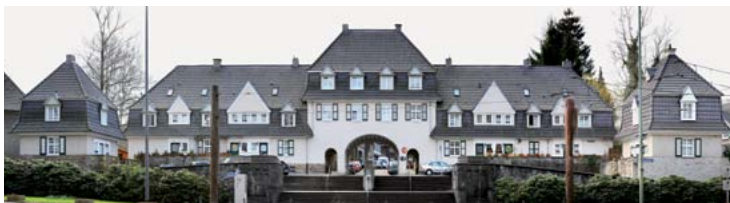
Brückenkopf of the Margarethenhöhe

4 hrs, free of charge, every 1st Sunday of the month, (May to October), 2pm to 6pm