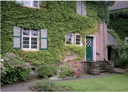
Model flat, 2010