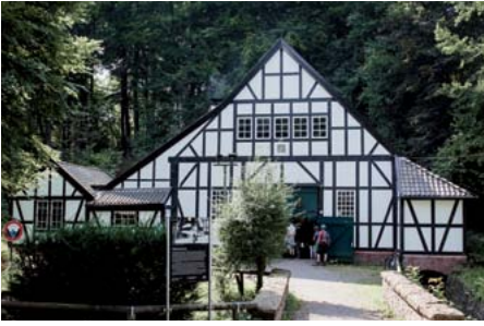
Halbachhammer (historic hammer mill for iron and steel production) at the Nachtigallental