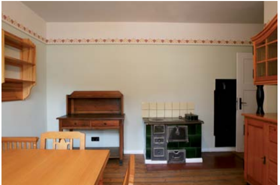
Interior view of the model flat at Margarethenhöhe, stove © Ruhr Museum, Photo: Rainer Rothenberg