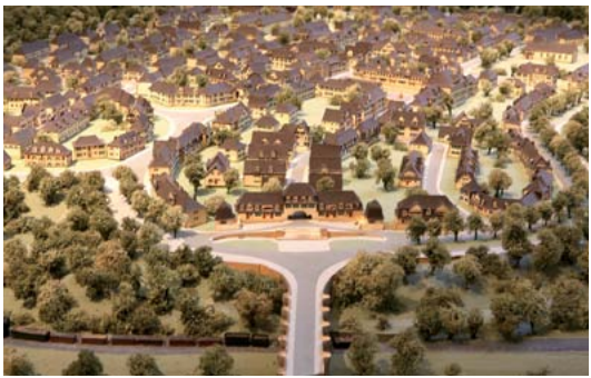
Model "Die Gartenstadt Margarethenhöhe" (garden city Margarethenhöhe), around 1935/40