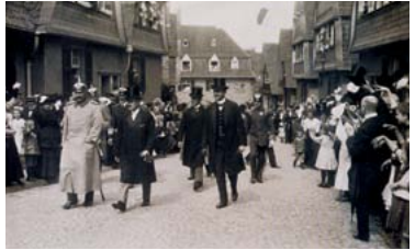
Kaiser Wilhelm II. visiting the Margarethenhöhe, 8 August 1912