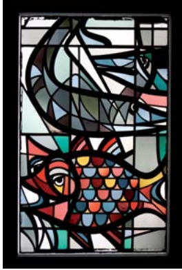
Stained-glass window from the Gruga park, around 1950, Philipp Schardt