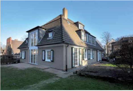
Garden view of the small studio house, 2012