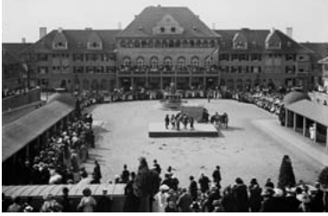
Small market with Hans Sachs games, 1913