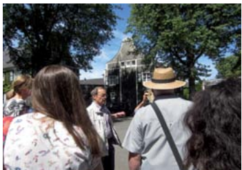
Guided tour of the Margarethenhöhe